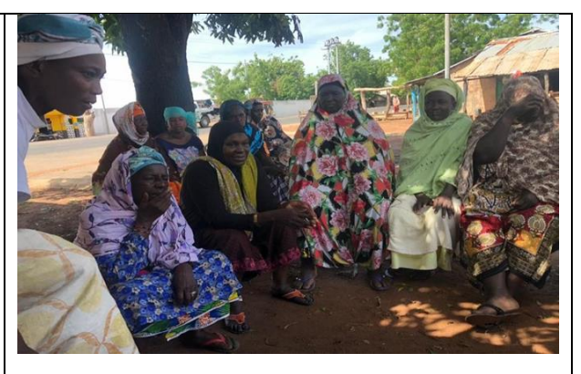
Consultations with an exclusively women's group in Pirang village