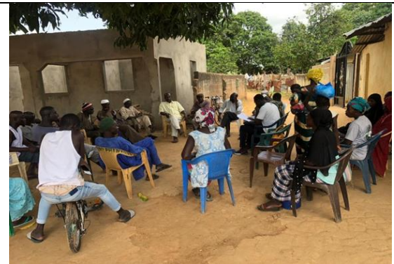
Focused Group discussions in Choya